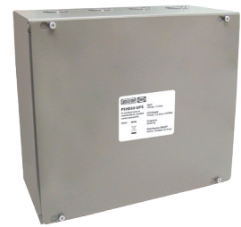
Shown With Cover