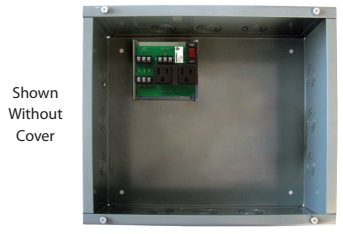
Shown Without Cover